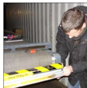
Innovation Improvements in efficiency, safety and quality are the key for Caljan and our customers.