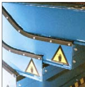
Safety Committed to maximum safety for all of our product designs.